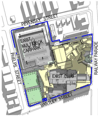
SHADOW DIAGRAM (Winter 9.00am)