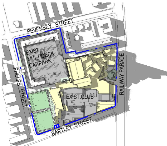
SHADOW DIAGRAM (Winter 3.00pm)